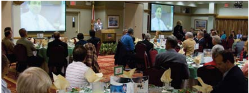
More than 145 people attended this year's luncheon.