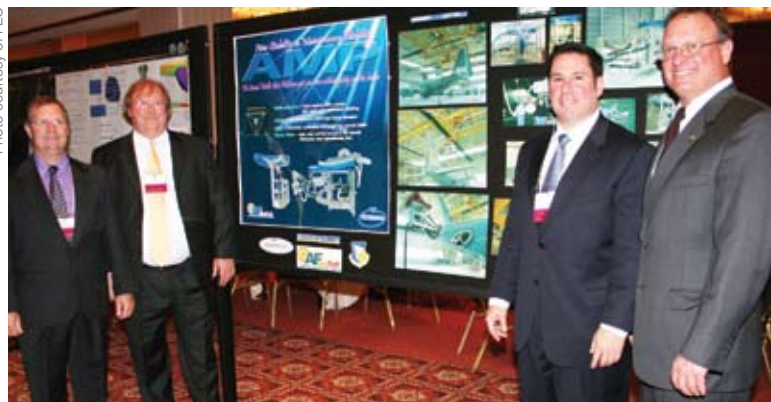
Exhibitors discuss their latest technologies during the 2008 FLC Awards poster session in Portland, Oregon.

NASA is unique among government agencies because it had a formalized technology transfer program established upon its creation in 1958. NASA was the first major government agency mandated to establish an agency-wide program to promote transfer of its technology outside of its technological capabilities and expertise.