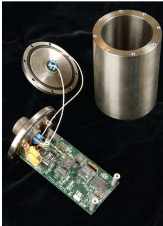
This current-to-voltage signal converter meets Space Shuttle Program requirements.

Det-Tronics is a registered trademark of Detector Electronics Corporation.