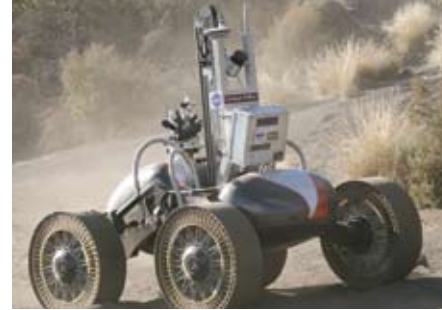
The lunar analog site at the University of Hawai'i-Hilo proved to be an excellent environment for testing innovative exploration technologies. The IPP Seed Fund helped make the November 2008 testing possible.

A 2007 IPP Partnership Seed Fund award to NASA's Kennedy Space Center enabled researchers to conduct lunar analog tests of In Situ Resource Utilization (ISRU) and Human Robotics Systems (HRS) technologies and methods.