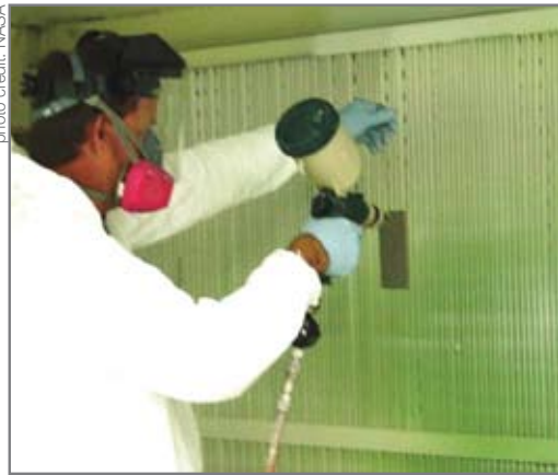
Kennedy's state-of-the-art facilities to study and develop new corrosion-inhibiting technologies include a beachside atmospheric exposure test site (see the cover), booths to apply innovative paints, and much more.